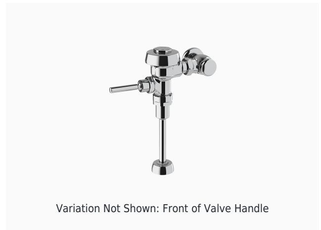
Variation Not Shown: Front of Valve Handle