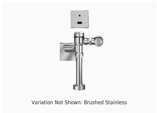
Variation Not Shown: Brushed Stainless