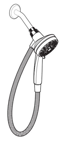
Engage™ Handshower with Bracket & Hose