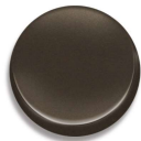
Oil Rubbed Bronze