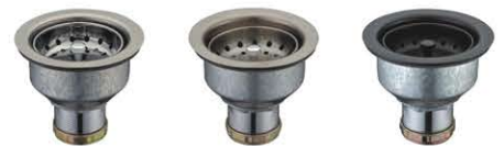
Deep Cup Basket Strainers