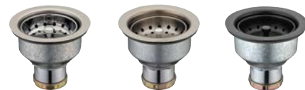
Deep Cup Basket Strainers