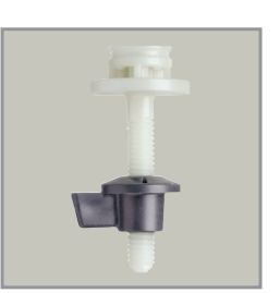
NON-CORROSIVE BOLTS AND WING NUTS