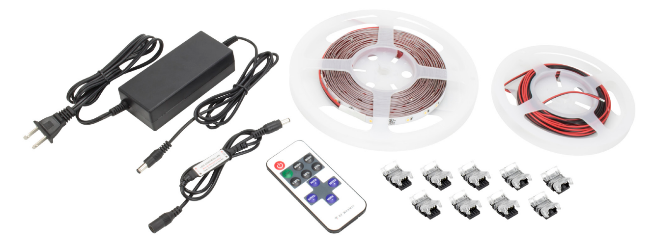
HTL-5MKIT includes: (1) 24V DC Plug-in Power Supply / (1) 15ft (20/2) Wire Spool (1) In-line RF Receiver / (1) Handheld Remote / (6) HD Power Feeds / (3) HD Splice Connectors